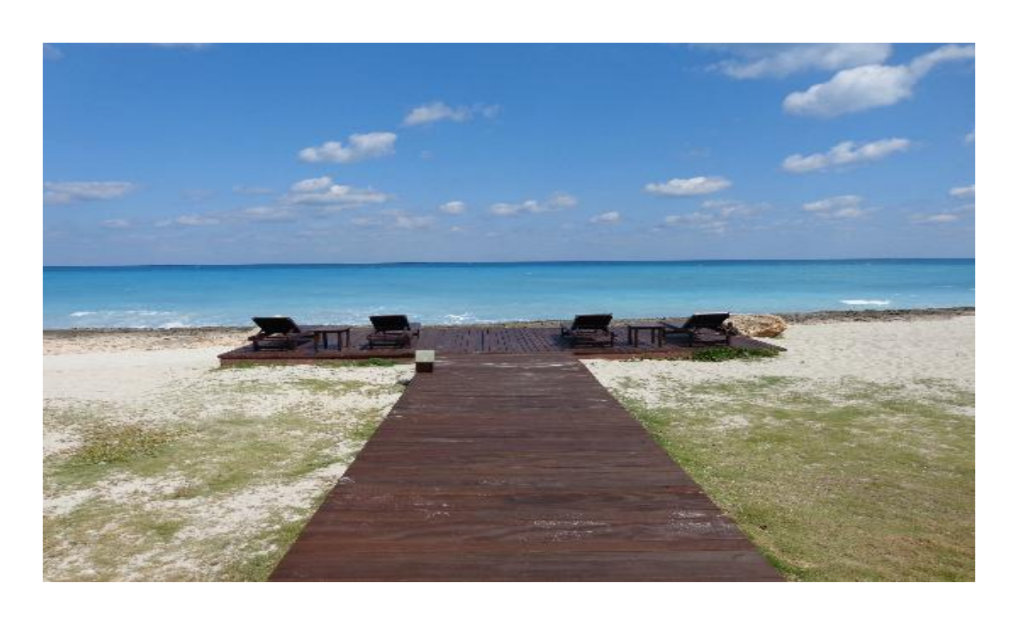
Case Study 3

Judgment of Tribunale di Verona (Italy), 2012