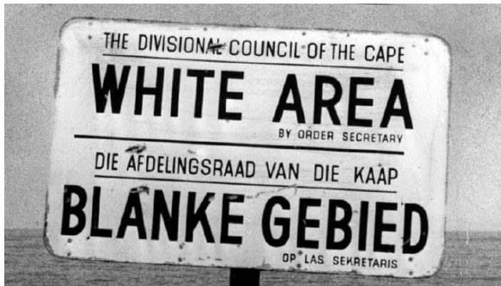
South Africa, apartheid from 1948-1990