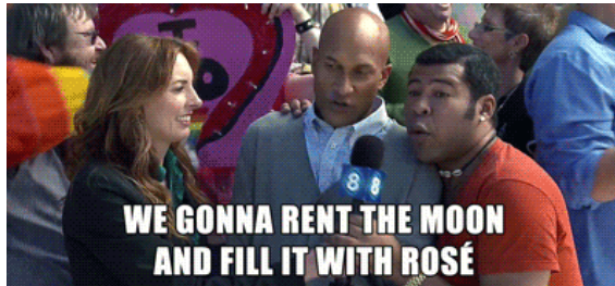
(Key & Peele, US comedians)